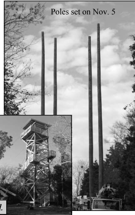
This tower is similar to what our tower will look like when finished.

We will periodically post pictures of the zip line's progress on the Camp's Facebook page along with other news as the Summer Camp season gets closer.